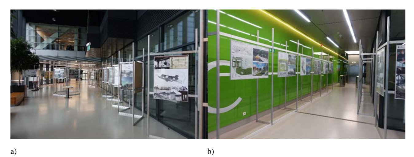
Figure 7: Exhibition of student compilations in Nowy Sacz, October 2017 part of the Conference on the Intelligent Model of Co-operation between University - Local Government - Business.

An excellent opportunity to present the best compilations and comparisons are periodic exhibitions organised in the building corridor of the Faculty of Architecture. The exhibition of partner projects made at the Faculty of Architecture of the Cracow University of Technology (Galeria Gil, Galeria Kotłownia, Kraków, ul. Warszawska) were organised in May 2017. The exhibition of student compilations related to the city of Nowy Sącz accompanied the conference in Nowy Sącz on the Intelligent Model of Co-operation between University - Local Government - Business, October 2017 (Figure 7).