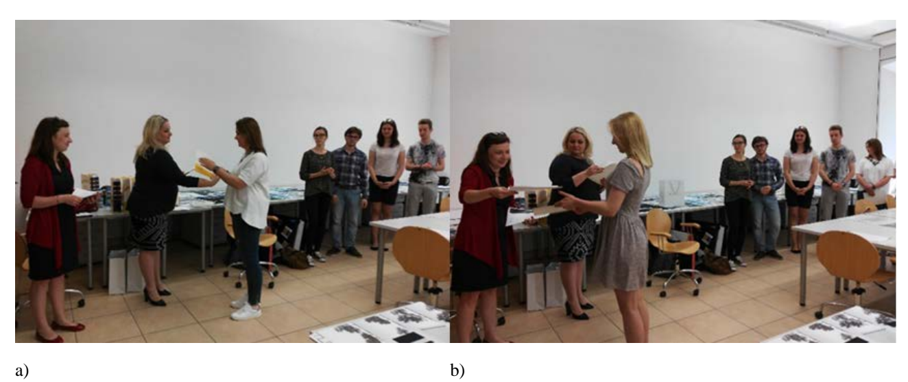
Figure 6: The final presentation of project compilations for the representatives of the city of Nowy Sącz, Aluprof and Norlys (Photographs by the author).