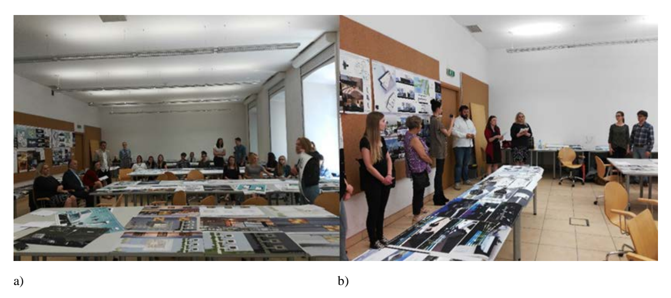
Figure 5: Final presentation of project compilations to the representatives of the city of Nowy Sącz, Aluprof and Norlys.

Presentation of the projects to representatives of local authorities, Aluprof and Norlys provide an excellent vehicle to develop presentation skills and to defend the decisions taken; all necessary in the later profession of architect (see Figure 5 and Figure 6).