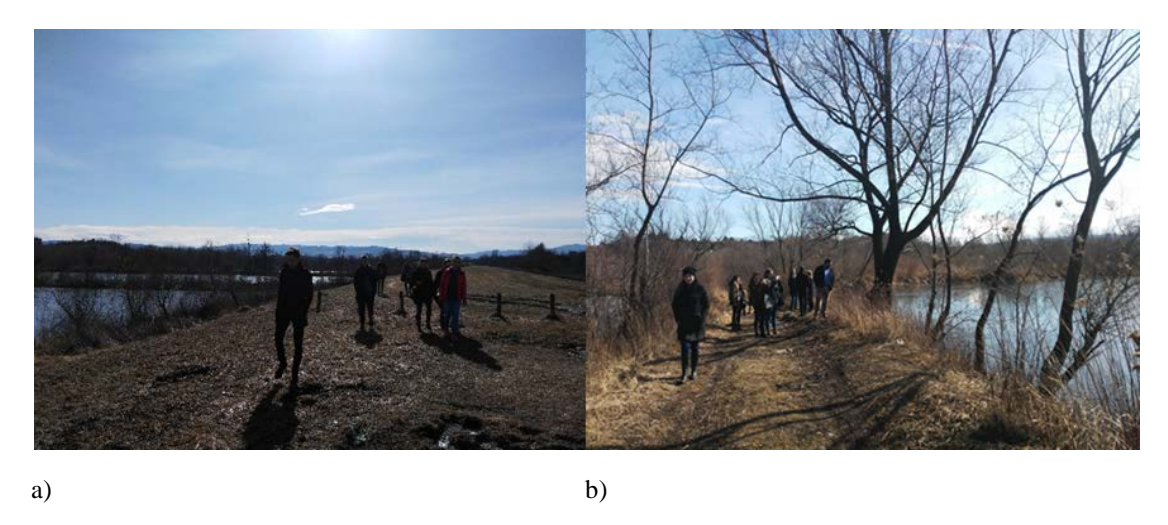
Figure 1: Students' arrival to the designated area in Nowy Sacz (Photographs by the author).

The programme included 26 students in two different age groups. The students familiarised themselves with the location indicated by the city of Nowy Sącz (see Figure 1). They were to design a single-family float house using aluminium elements, glazed curtain walls made by Aluprof and external lighting from Norlys.